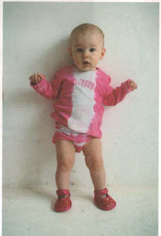
Inul (7 mos.) goo goo ga goo goo ga.